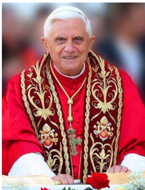
Pope Benedict XVI

(Church of England Board of Social Responsibility Report